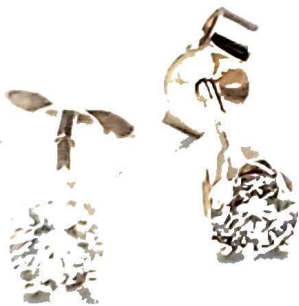
ITEMS SHOWN IN THIS SIZE HAVE BEEN ENLARGED FOR VISUAL EFFECTS

Item description 9ct Yellow gold Diamond Earring Studs - each four claw mount has one Round brilliant cut Diamond and is finished with a fitted post and butterfly backing. Metal Purity 9ct Yellow gold Gems 2 claw set Round brilliant cut Diamonds 3.90mm = 0.48ct Known Weight Colour & Clarity K P1 Weight 0.83gms