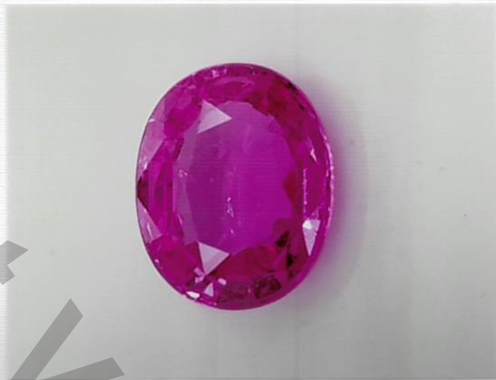
The photograph above shows the gemstone magnified at the time of examination and may be used to re-identify the stone should the need arise in the future. Due to varying behaviour of some gemstones under different lighting conditions, variations in colour may occur in the photograph when compared to the stone.