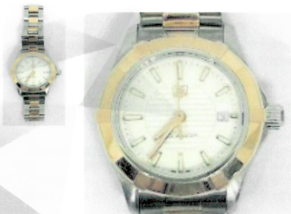
IMAGE NOT ACTUAL SIZE & HAS BEEN ENHANCED FOR VISUAL EFFECTS